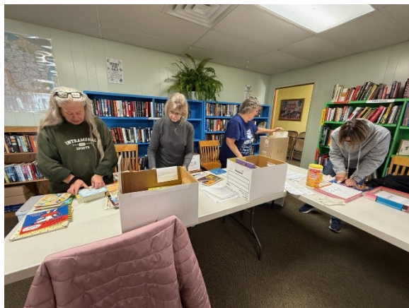
LV-MC members sorting

Literacy Volunteers-Marquette County's annual Tots to Teens Book Drive produced about 1000 donated books from drop-off points at county libraries, schools, and churches. The book giveaway was held in conjunction with the Giving Tree program on Saturday morning, December 14 th , at Trinity Methodist Church in Montello. Board members cleaned, sorted, and labeled books at our December 7 th board meeting. New graphic novels were purchased to add to the donations.